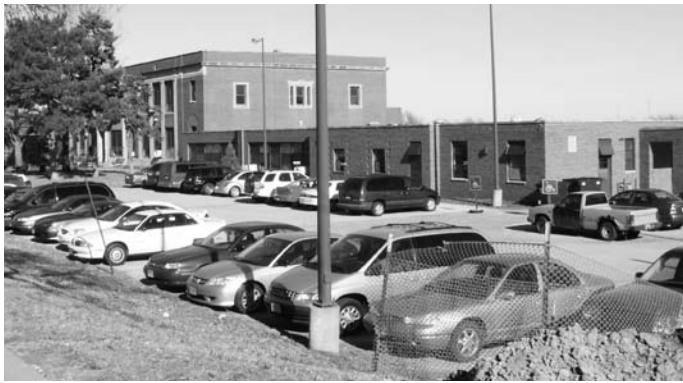
Hawthorne Elementary 48th and M