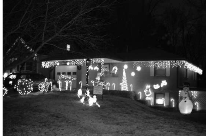
5101 M Street

The Kaufman family at 5101 M Street won first