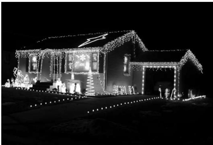
5041 L Street

35th, 3350 N St, 3315 M St, 3353 M St, 3511 M St, 3706 M, 3400 Woods Blvd, 619 S 34th, 3330 J St, 3340 J St, 3612 Randolph St, 3923 H St, 417 S 40th St, 401 S 40th St, 140 S 40th, 4300 Witherbee Blvd, 4306 L St, 4436 Witherbee Blvd, 4811 L, 4844 J St, 5041 L St, 5101 M St, 630 S 52, 5500 L Street, 5511 L Street, 325 S 54th, 55th & M Street.