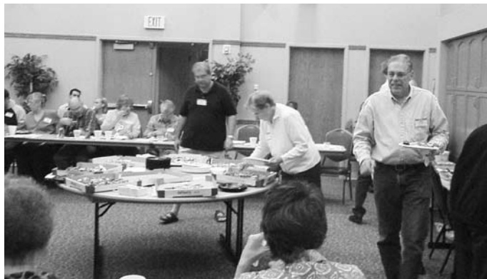
Pizza and salad were enjoyed by all

The annual program included time for visiting and enjoying DaVinci's pizza and a large variety of salads and deserts brought by residents.