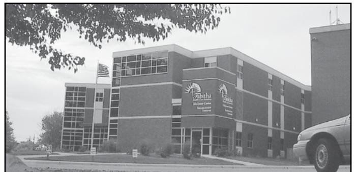
Enter doors under Tabitha sign for Witherbee Meeting.