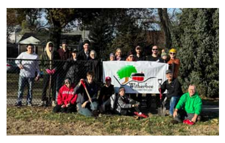
Neighbors and Boy Scouts take a break from planting to pose for a picture at Witherbee Park on November 23, 2024.