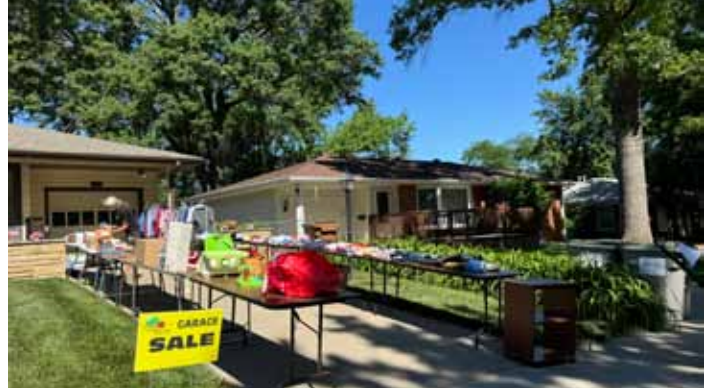
Two of the 27 homes that participated.