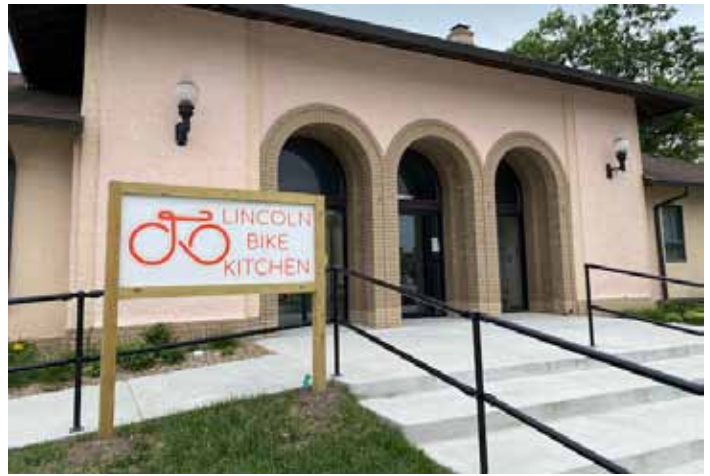
Lincoln Bike Kitchen's new home.

For more information or to make a donation visit lincolnbikekitchen.org . Welcome to the neighborhood Lincoln Bike Kitchen!