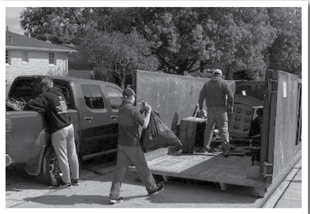
Unloading all of the litter at last year's Cleanup Day!

The WNA Spring Cleanup is back! It's been a long winter, let's get the neighborhood looking good for summer.