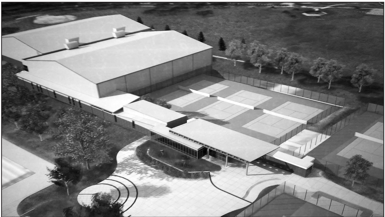
Architects final schematic for the Woods Park Tennis Complex.