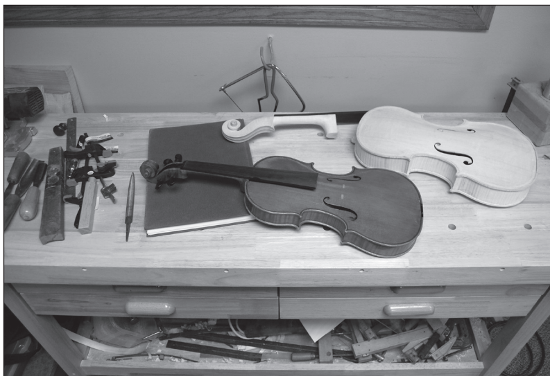
Partially finished violins and construction tools

In addition to making instruments, Marilyn offers a variety of services for all string players: advice and assessment; museum quality repair; maintenance; rental and rent-to-own; purchase and trade-in; cases and accessories; bow repair and bow rehair. Capital City Strings exhibits and represents instruments and bows from