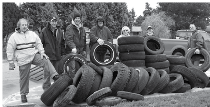
Volunteers load scrap tires at the WNA Cleanup in 2013.

This cleanup event is funded by a grant from "Keep Lincoln and Lancaster County Beautiful". Food and beverages are donated by Braeda & Midtown Hy-Vee. Refuse hauling is provided by Niederhaus Refuse Services at a discounted rate.