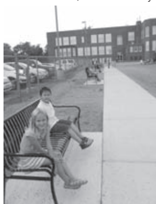
New buddy benches line new walking path.