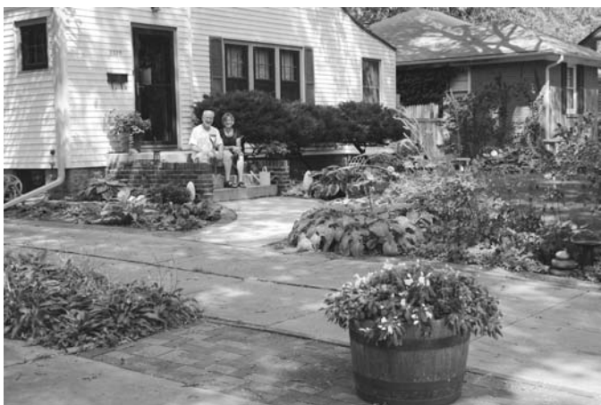
Front yard of 3320 N St.