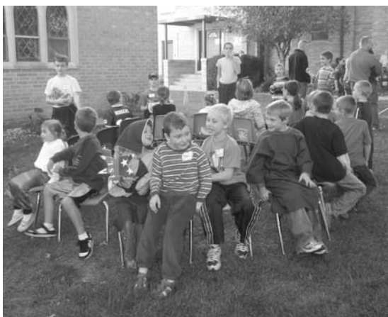
Children playing musical chairs