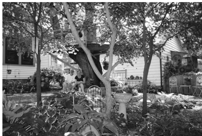
Back yard is anchored by an ancient tree.