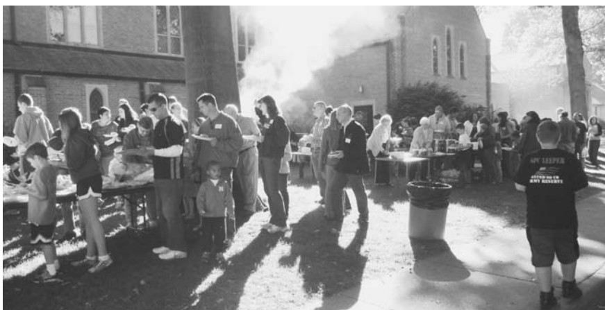
People line up to choose from a great selection of foods.