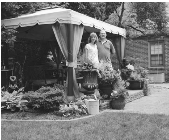
Many containers are used in back yard.