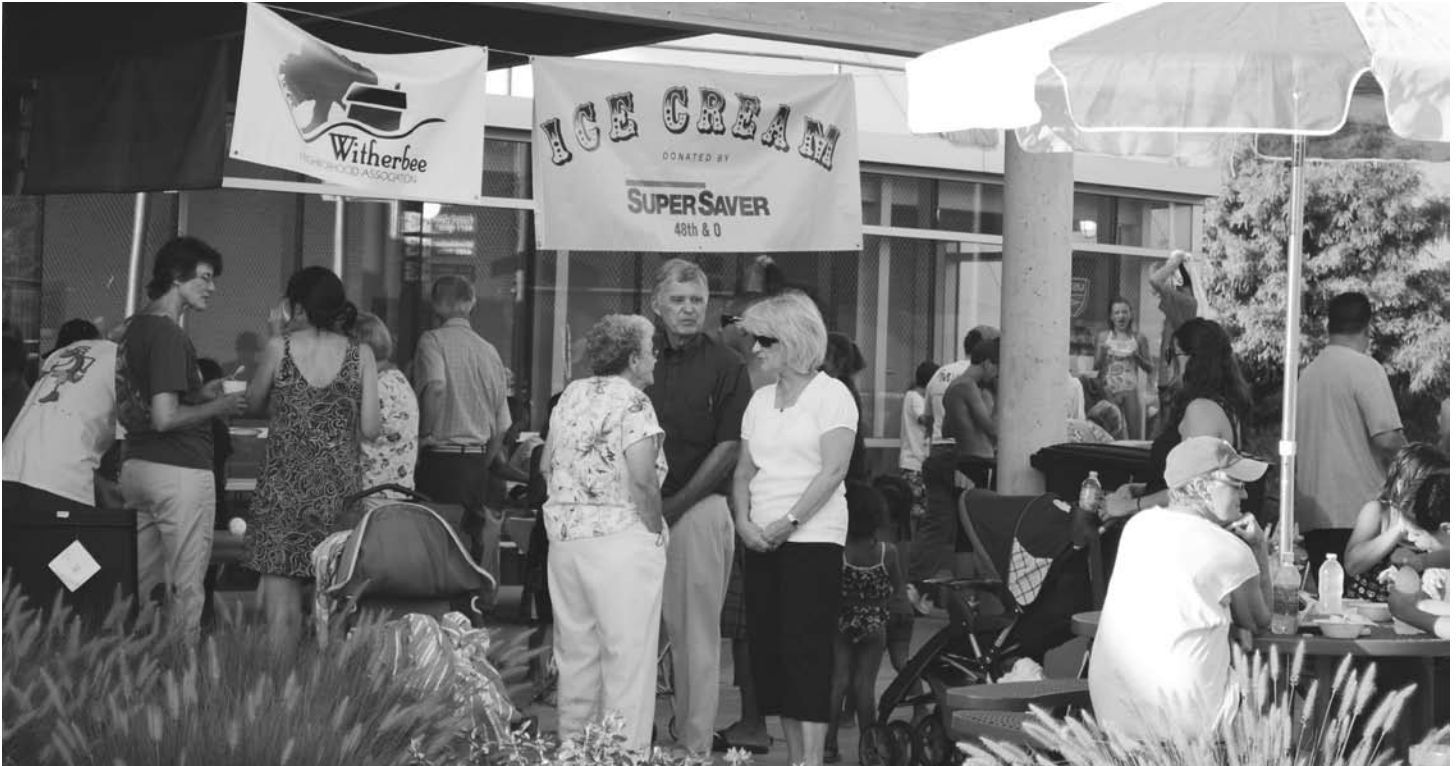
Over 500 neighbors and friends gathered.

Touting last year's Swim/Ice Cream Social as the largest neighborhood event of the year, this year neighbors came out in "waves" to enjoy the beautiful, warm weather, the cool water of Woods Pool and of course refreshing ice cream. The night saw 420 Witherbee neighbors of all ages, a new attendance record, take a free dip in Woods Pool and play in the "sprayground" water park.