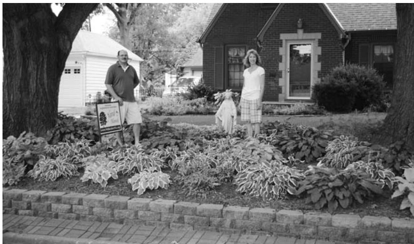
Hostas and ferns provide front yard color all season.