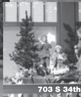
703 S 34th