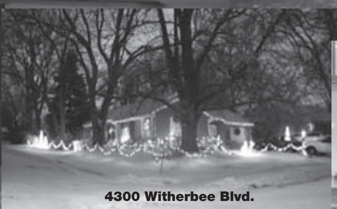
4300 Witherbee Blvd.