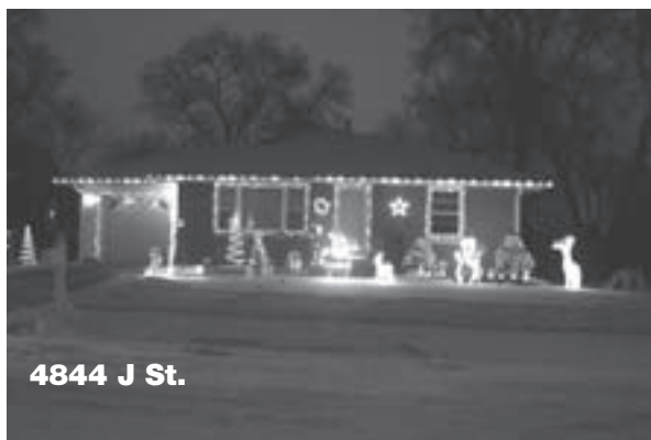
4844 J St.