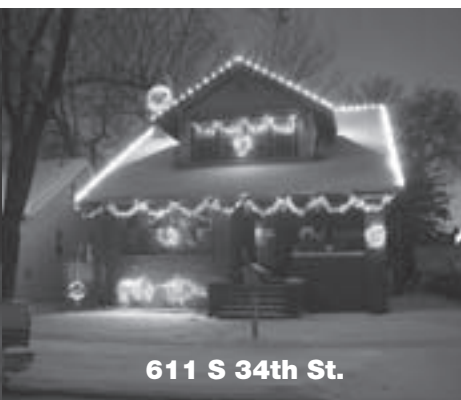
611 S 34th St.