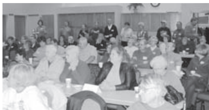
Standing room only at WNA annual meeting. More on pg. 8

There will be plenty of time for question and answers. You won't want to miss this meeting.