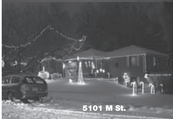
5101 M St.