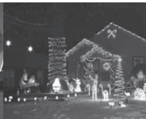
4306 L St.