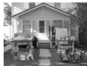
Ready for the Sale.

Unlike last year, residents didn't experience too much heat for this year's garage sale. The good weather and doing our sale on the same weekend as the 40th and A neighborhood helped all of us have a good sale.