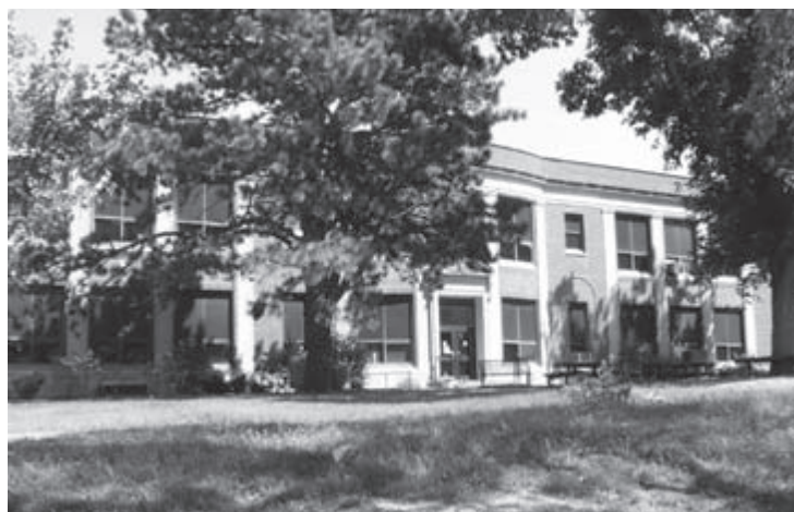
Hawthorne School building basks in August sun while Lincolinites ponder an uncertain future.

WNA members passed a resolution at their August 2nd meeting to oppose the closing of Hawthorne Elementary. The WNA Board of Directors is studying the issue and will render their recommendation soon.