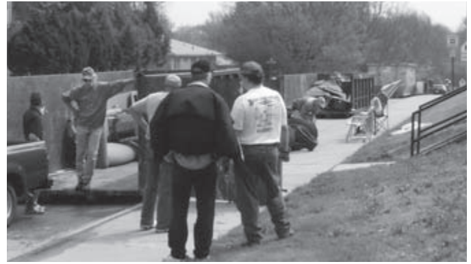
Volunteers wait for another load.

The weather had only delayed a very successful event. Two large roll-offs were filled with general trash from the contributors. Several new residents were thankful for the opportunity to rid themselves of their unwanted materials at a low or no cost in a very convenient location. A flatbed trailer and pickup load of building materials were sorted out and donated to the Eco Store for recycling. Others dropping off took some things home for they had need of it. A free swap meet evolved under our volunteer super-