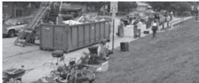
Several dumpsters were filled at 2006 WNA cleanup.

The 4 th annual Witherbee Neighborhood Association cleanup will be held Saturday, May 5 th , from 8 a.m. to 12 p.m. In conjunction with the neighborhood-wide cleanup, collection of litter and removal of illegal signs from designated city right-of-ways will be done by volunteers. These activities will take place rain or shine, with the litter pickup