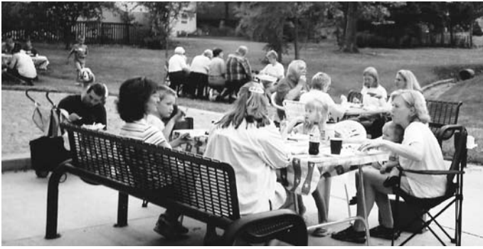
Families gather regularly to enjoy fellowship in the park